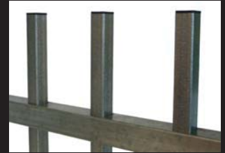
CAPPED HEAVY SECURITY